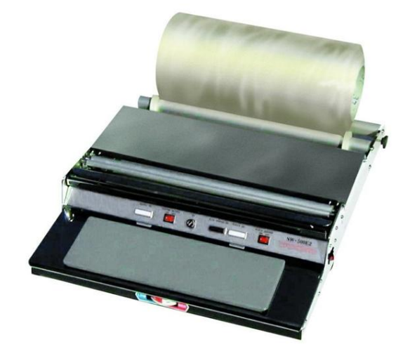
Table Top - 450 mm Stretch Film

The machine detailed on this sheet is designed for the sealing and wrapping of cooked and raw foods. It can provide the high quality and hygiene every professional kitchen requires.